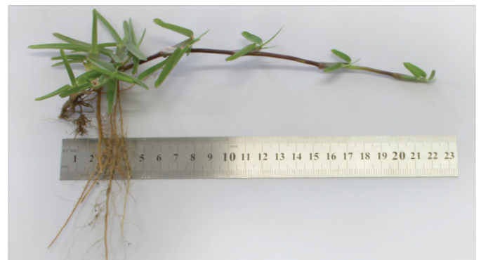
Fig 3. close-up of live stolon