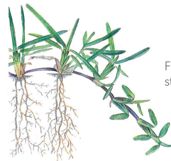
Fig 1. stolon and leaf structure illustration